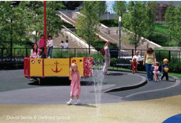
David Seide © Defined Space