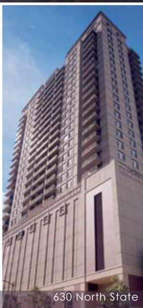
630 North State