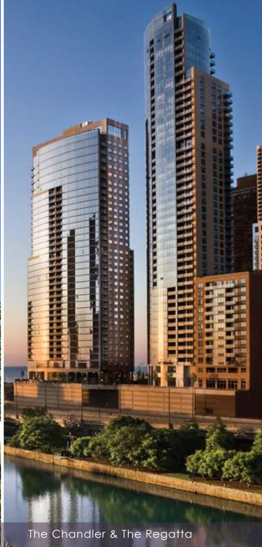
The Chandler & The Regatta