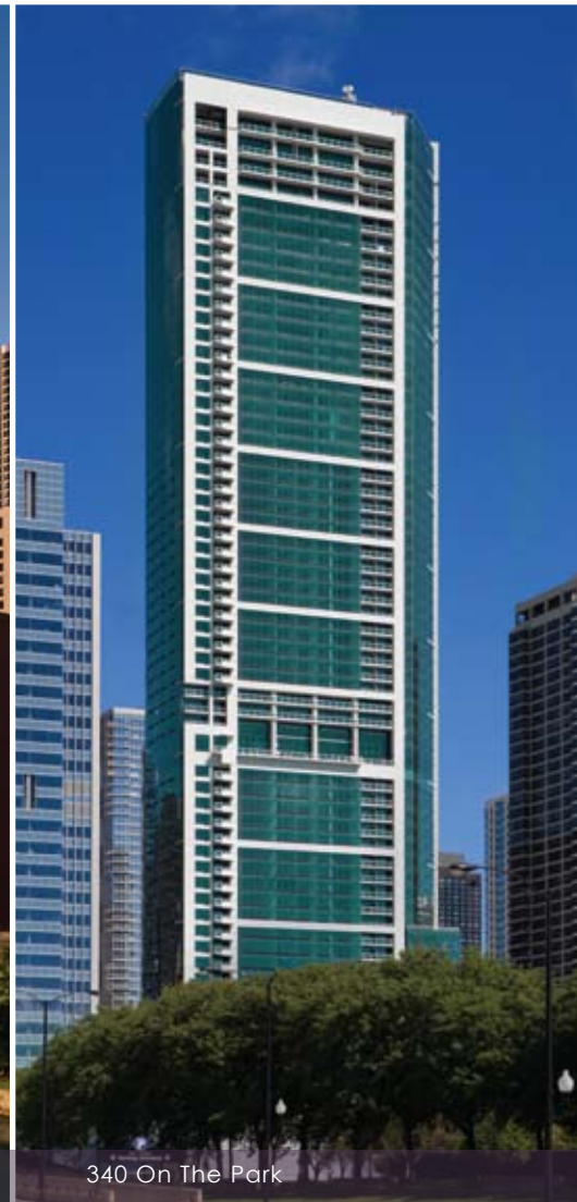
340 On The Park