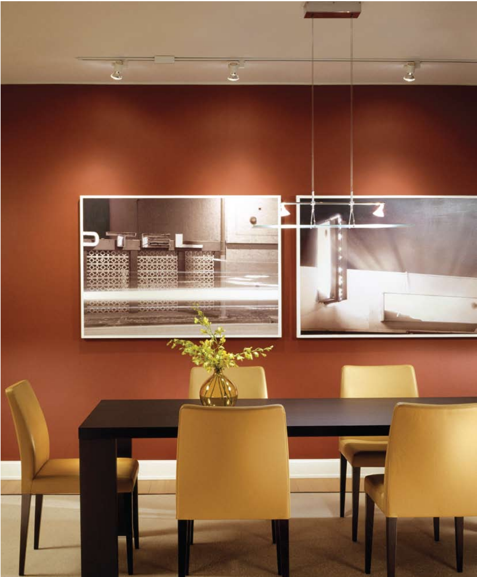
Dining room interior at 340 On The Park at Lakeshore East