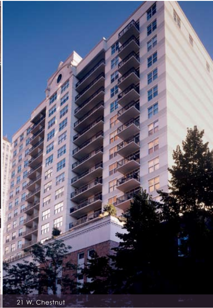
21 W. Chestnut