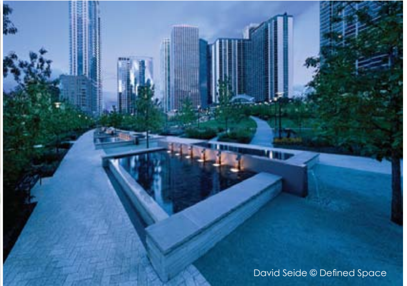
David Seide © Defined Space